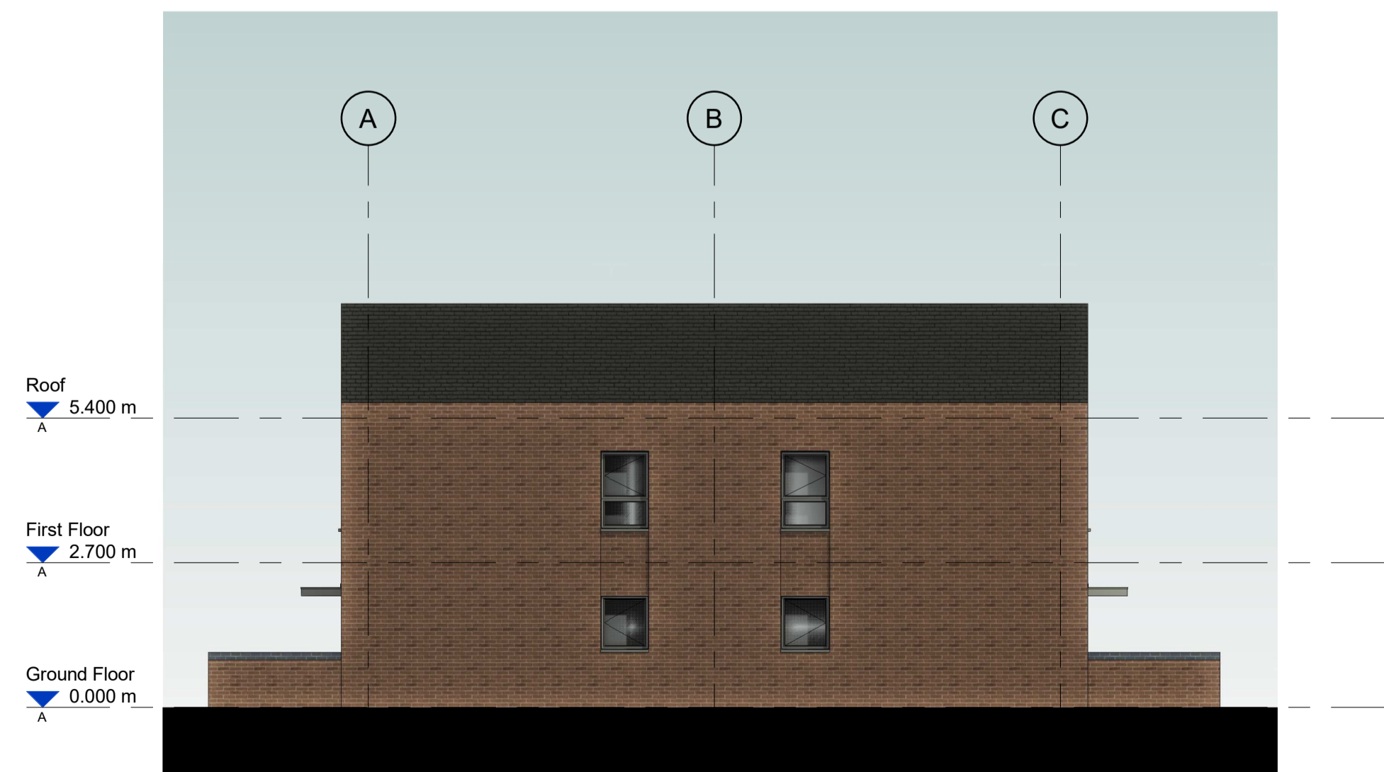
4 SOUTH-WEST 1 : 100