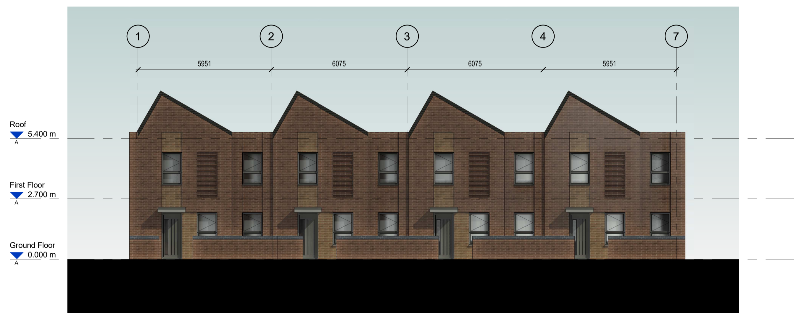
2 SOUTH-EAST 1 : 100