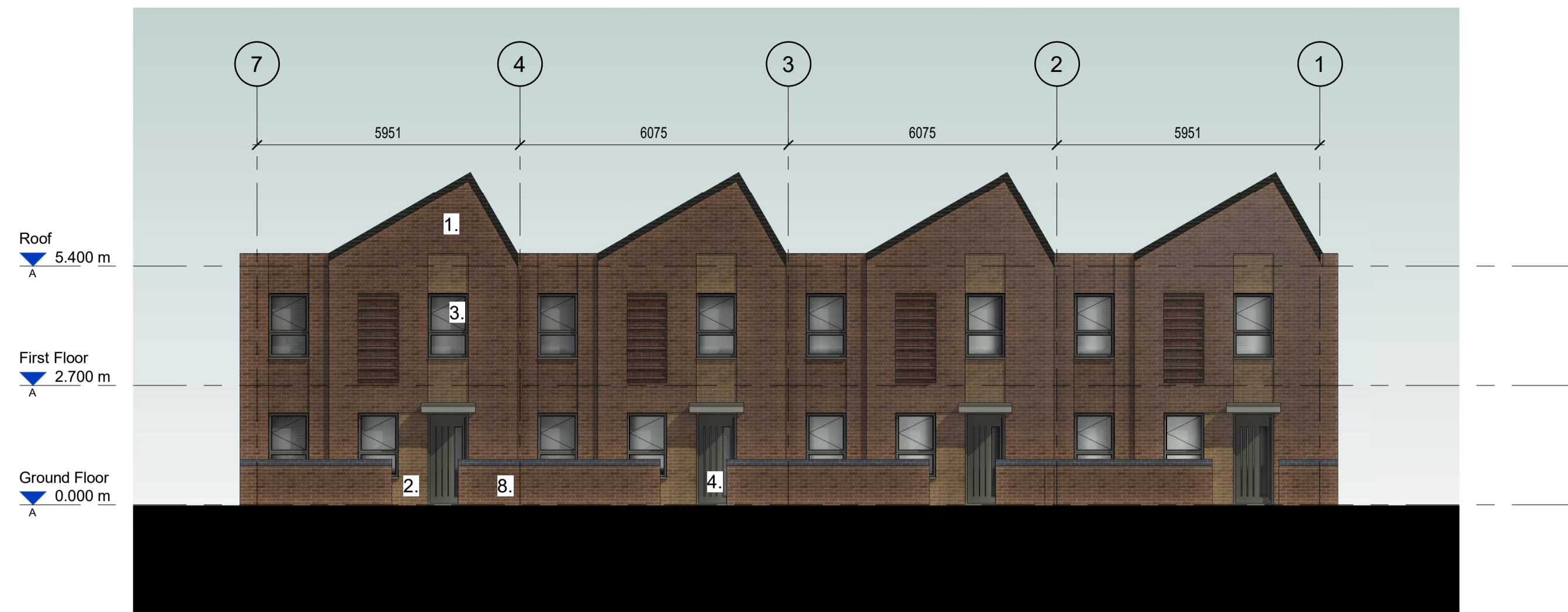
1 NORTH-WEST 1 : 100